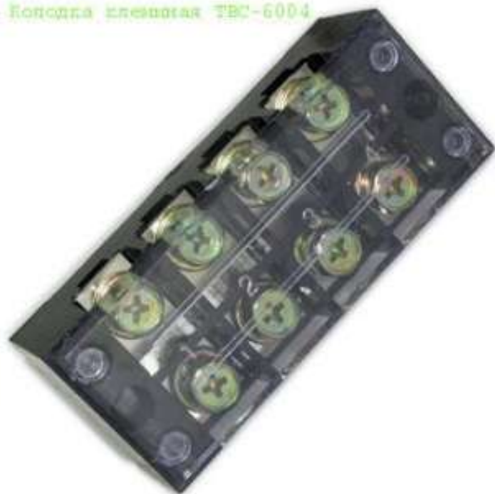
Розетка клеммная TBC-6004